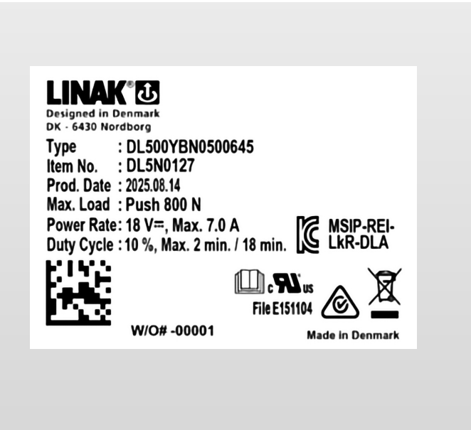
Example of the product label